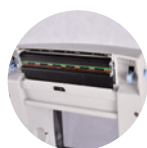
Printer Head Quick Replacement