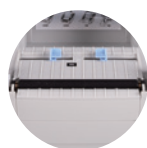
Auto Paper Type Detection