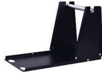
Optional External Paper Roll Holder