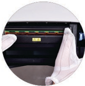
Printer Head Quick Replacement